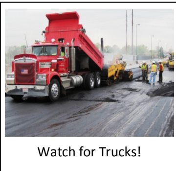
Watch for Trucks!