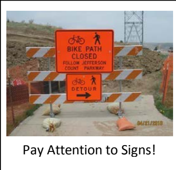
Pay Attention to Signs!