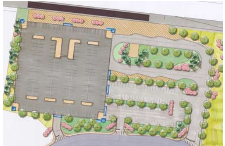
Layout for Lucent Station

resources, natural resources, wetlands impacts, visual and aesthetic resources and parklands. All of these will be addressed through mitigation measures to reduce or eliminate impacts. These measures include best management practices such as using erosion and sedimentation controls during construction, adding stormwater controls to the stations, and landscaping.