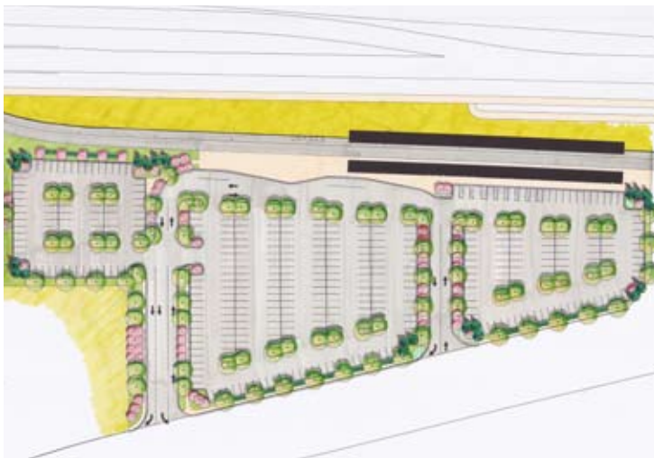
Layout for intermediate station (not a part of FasTracks Plan)

5 There is the potential for an additional station. Though currently not part of the FasTracks Plan, an intermediate station, which is proposed south of C-470 and west of Erickson Boulevard, could be added at a future date when funding permits. The extension was designed so that this station can be easily added. The intermediate station would include a 400-space park-n-Ride, kiss-n-Ride drop-off area, and bus pull-outs accessed from Blakeland Drive. The station would also include pedestrian connections, which would benefit residents of the Wind Crest and Highlands Ranch communities.