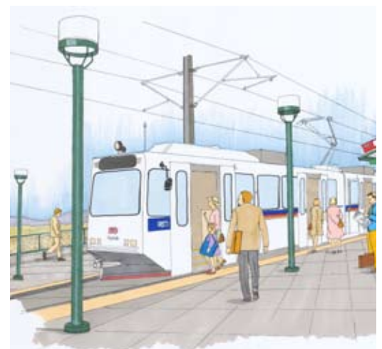
Typical RTD Light Rail Station Platform

3 The planned line won't interfere with traffic, bicycles or pedestrians. The light rail crosses over three road crossings, two railroads and two trails. All of these crossings are grade-separated, which means that the light rail tracks will be fully separated from street traffic. Importantly, the new line does not interfere with the accessibility of the C-470 bike and pedestrian trail or the High Line Canal.