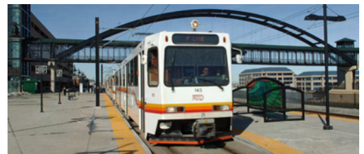
Existing Southeast Corridor Light Rail Station at Lincoln