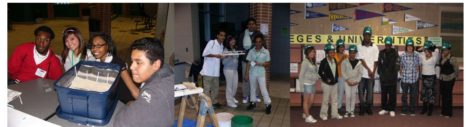
Utility relocation exercise

The Ride to Dream school program was conceived as a way to encourage young people to explore careers in planning, engineering, construction, and other transportation related fields. The primary goals of the program were to educate students about the FasTracks I-225 Light Rail project; to identify scholarship, college, and career opportunities in the transportation industry; and to provide mentoring opportunities with transportation professionals and other students. To learn more about Ride to Dream or to see what the students achieved in this program, visit the I-225 section of the FasTracks website at www.RTD-FasTracks.com .